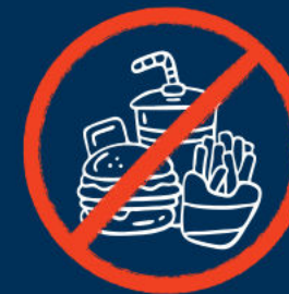
Outside Food and Drinks